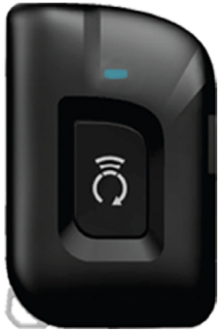
Micro USB Charging port

Your handheld remote control contains a long-lasting Li-Ion battery that can be recharged with a micro-USB cable (supplied). It is recommended that the battery be fully charged before the first use for maximum efficiency and range. During normal operation, the battery will last for approximately 1 month before recharging is required.